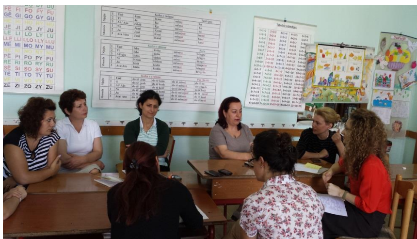
Photo with the a group of teachers and MoES representative in Tirana

From the mentoring process it was evident that teachers became more confident and comfortable instructing children based in their specific needs. They became more sensitive to the individual needs of children and used more child-centered, interactive teaching strategies in their classrooms.