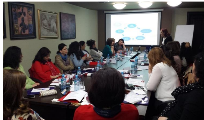
Photos of the training for the inclusive education training in Tirana

The gap between theory and practice is a major concern related to the education of the teachers. Teachers showed difficulty during the training regarding the adaptation of the theoretical information into their work practice. Training provided the opportunity for the teachers to increase the level of their understanding of the comprehensive education, since empowering teachers' professionalism is a key factor to promote participation and learning for all pupils. The main purpose of the teachers is to bring together the pupil, the curriculum and the context for a qualitative education for more positive results. Training and its methodology helped teachers understand that it is not enough to educate teachers individually; teachers must develop their practices in teams sharing their experiences with each-other, asking for support from their colleagues and other professionals, using various methods and techniques according to the context and specific needs of every child and providing an inclusive view. Teachers and