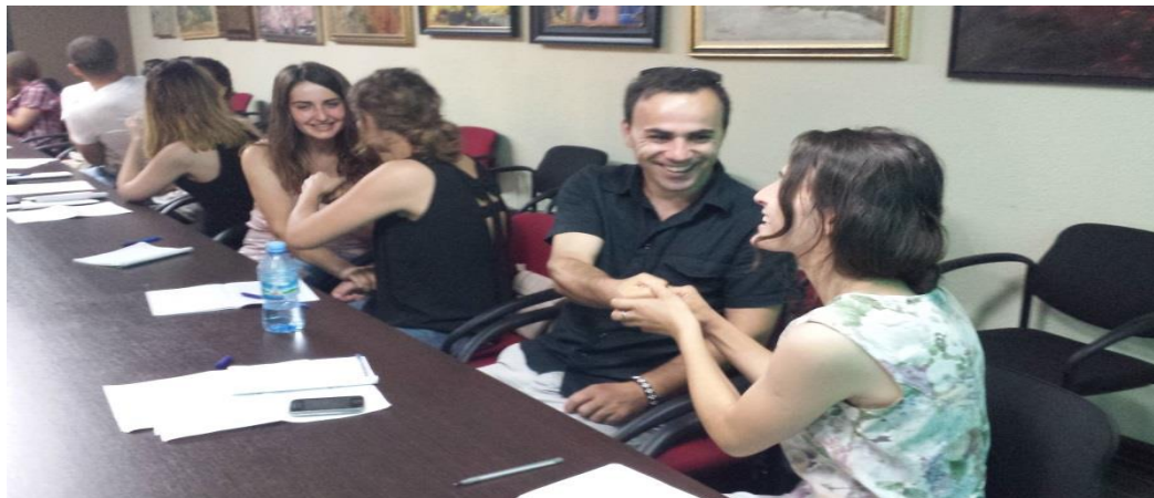
Student from the Faculty of Social Sciences and Teaching Faculties in Gjirokatra Shkodra, Durres and Tirana during a training on inclusive education

Students of teaching profiles, those of social work and psychology participated in a 3-day training for inclusive education. 60 students from Tirana, Shkodra, Durres and Gjirokastra were trained. Students that participated in the training had an experience of internship at schools that are part of the project of inclusive education. Internship at schools offered the opportunity for the students to observe directly the practice of the teachers who were trained for inclusive education. This experience helped the students to understand the information they obtained during the training, relating it continuously to the situations they observed at schools. Observations are a critical component of what teachers do, and reflecting on the feedback will help students to improve their own performance, and therefore the performance of classroom teachers as well.