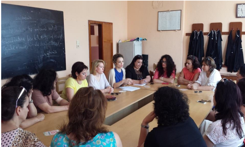
Photo with the a group of teachers and MoES representative in Shkodra

Secondly , the planning, organization and conduction of activities aiming to make schools inclusive requires a new role of teacher, the role of inclusive teacher where is necessary the adaption of a learning process that depends on needs and skills of students with special needs is the underlying goal.