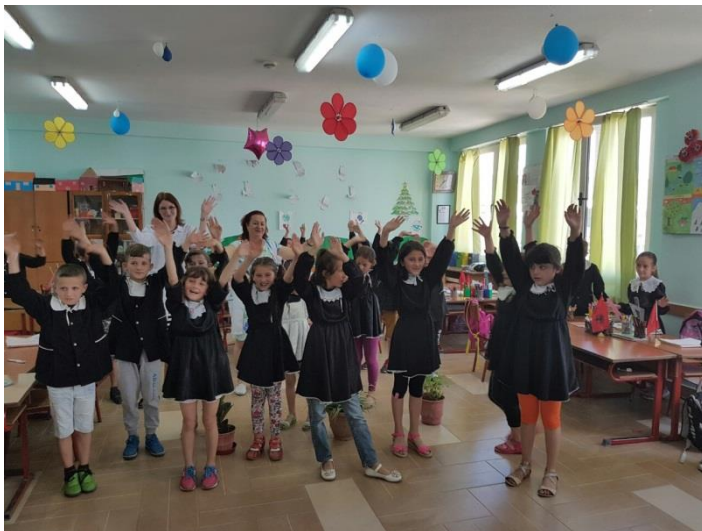
Photo from Androkli Kostallari School, Tirana

Some of the elements that have been reported as positive by the students are: collaboration, vocation, constructive communication, positive attitude that teachers show to students, triggering of participation and this is especially important in their views, because they consider the teacher a model who, beside their knowledge they teach, speaks and teaches better through